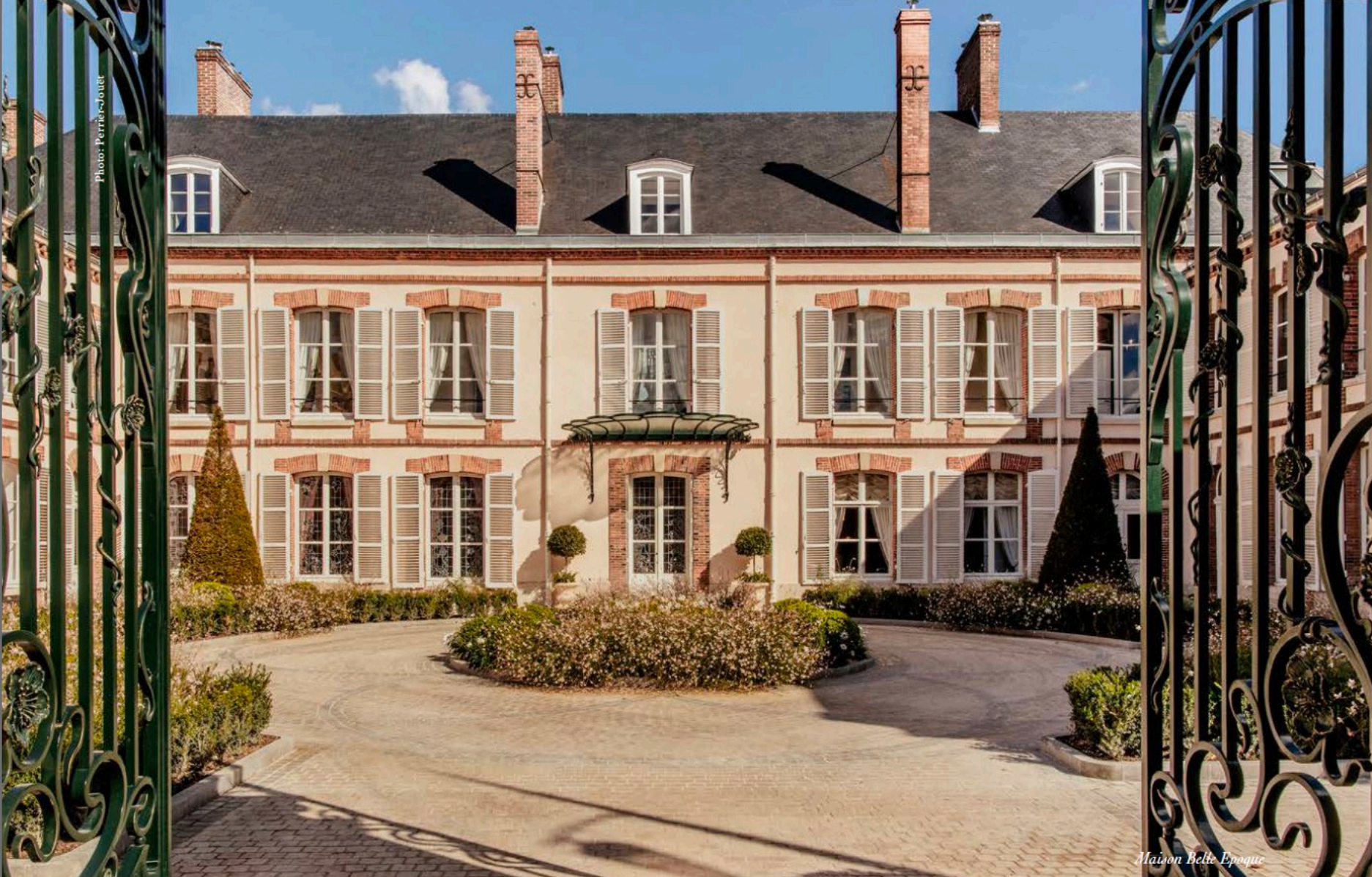
Maison Belle Epoque

At Christie's, I am fortunate to be involved with exceptional sales direct from the Champagne Houses. These sales have been highly successful largely due to the exemplary provenance of the bottles that are drawn directly from their cellars. Collectors are keen to acquire these vinous gems as opportunities like this do not come around very often. This creates a buzz around the auction and the high demand results in competitive bidding that can lead to unprecedented winning bids.